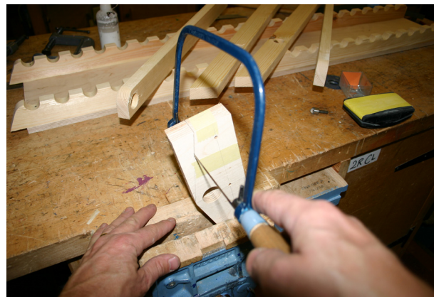
Step 6: Cutting out shaped parts