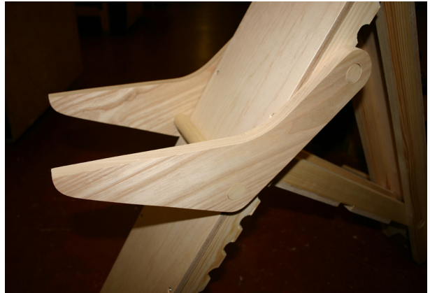
Step 10: Seat rails