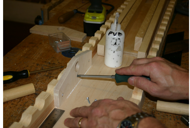
Step 8: Screw and glue bracket