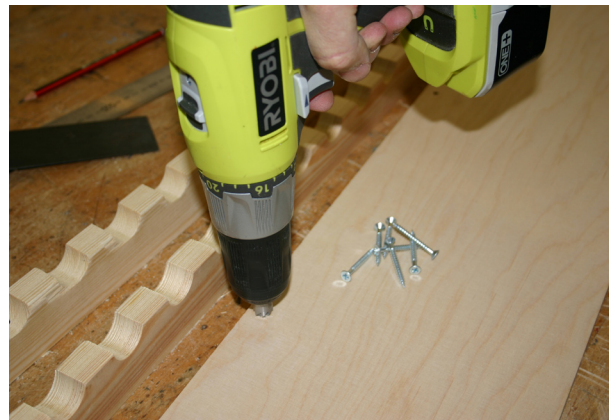
Step 4: Countersinking