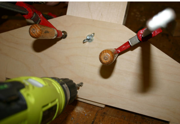
Step 11: Fixing spreader