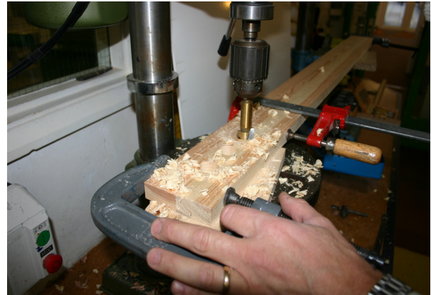
Step 2: Drilling holes