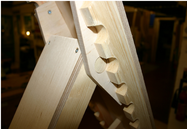
Step 9: Dry fit parts