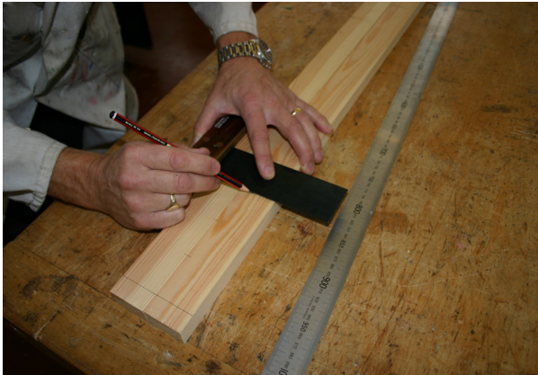
Step 1: Marking out