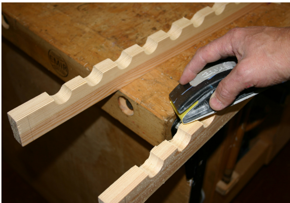
Step 3: Hand sanding