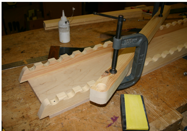
Step 5: Gluing