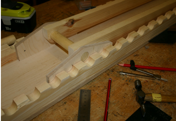
Step 7: Dry fit bracket