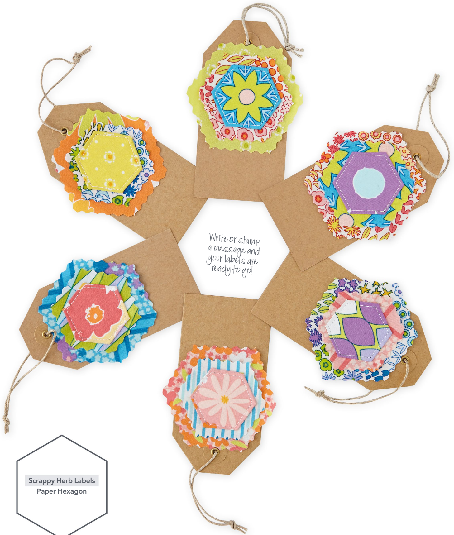
Scrappy Herb Labels Paper Hexagon