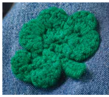
Groups of five trebles are worked in Row 3 to form the full, curvy parts of the leaves.

Row 2 Ch1, (ss, dc, htr, tr, htr, dc, ss) into each ch-2 sp, ss into dc at top of stalk, turn. [7 sts in each leaf] Row 3 *Ss into next ss, dc into next dc, 5tr into next htr, ss into next tr, 5tr into next htr, dc into next dc, ss into ss;