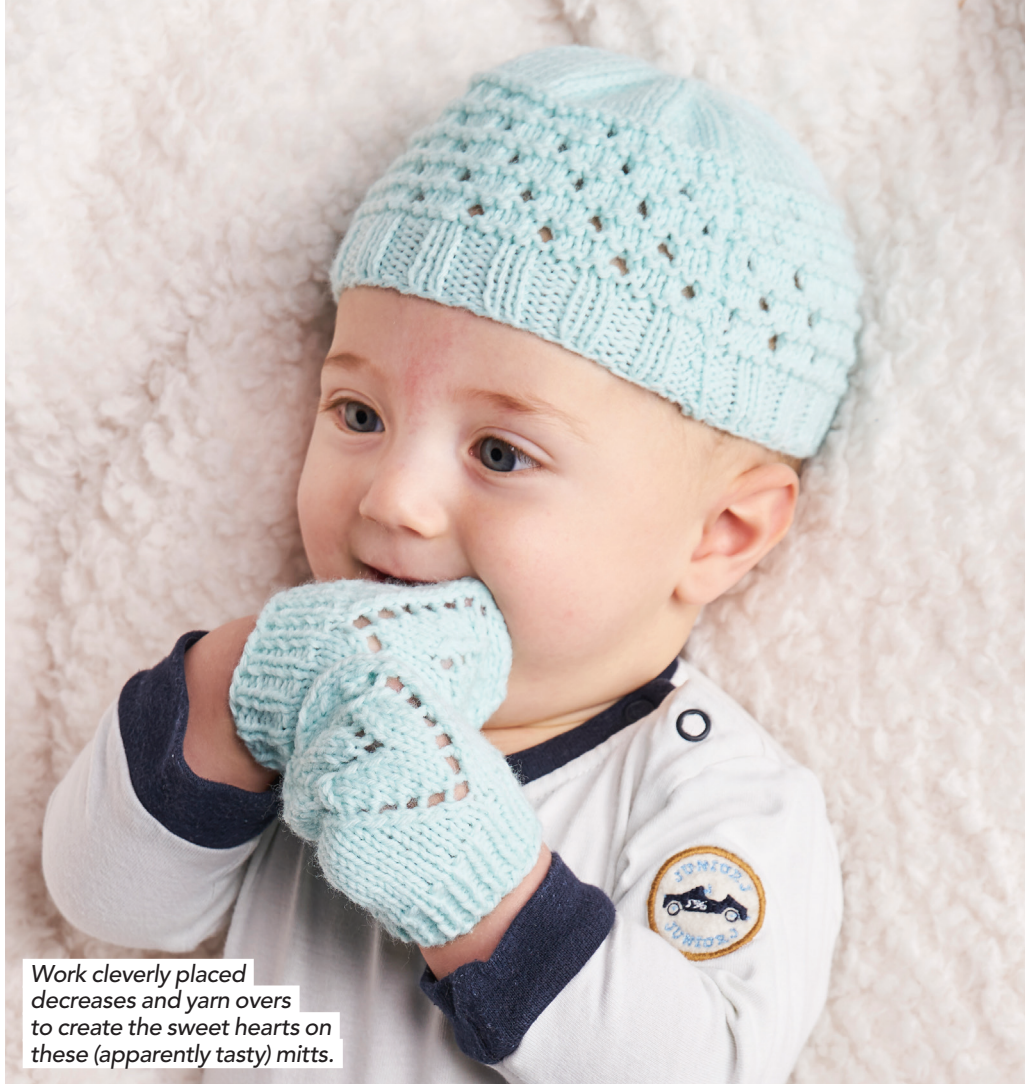
Work cleverly placed decreases and yarn overs to create the sweet hearts on these (apparently tasty) mitts.

Continue to work from the Chart or Written Instructions as set.