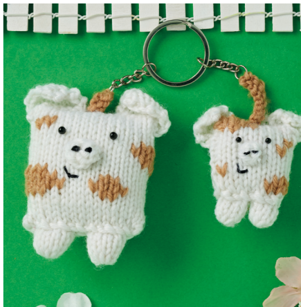
Use yarn in your stash to create a whole farmyard of brilliant animal keyrings!

Cast on 8 sts using Yarn A. Work 2 rows in st st, beg with a K row. Break off yarn and thread through rem sts.