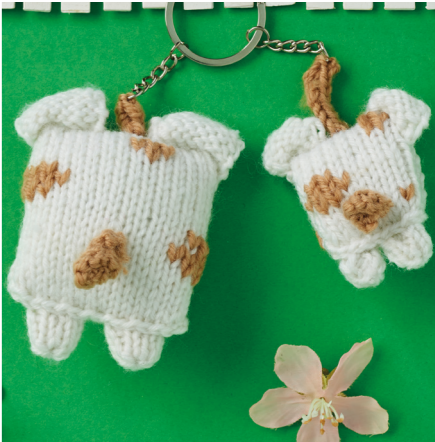
Cast on 9 stitches and then cast them off to create the cord to attach the keyring.

Cast on 8 sts using Yarn A. Work 3 rows in st st, beg with a K row. Break off yarn and thread through rem sts.