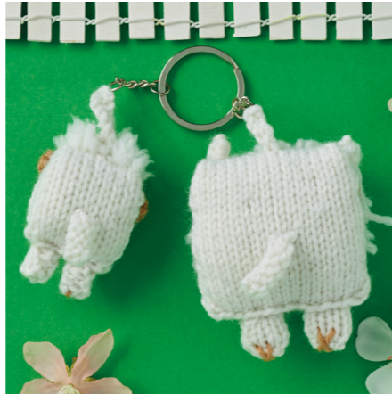
The tails are created by casting on 7 sts, knitting 2 rows of st st, then casting off.

Cast on 3 sts using Yarn B. Work 4 rows in st st, beg with a K row. Break off yarn and thread yarn through rem sts, pulling tightly to secure.