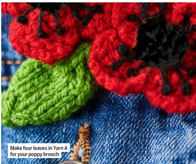
Make four leaves in Yarn A for your poppy brooch