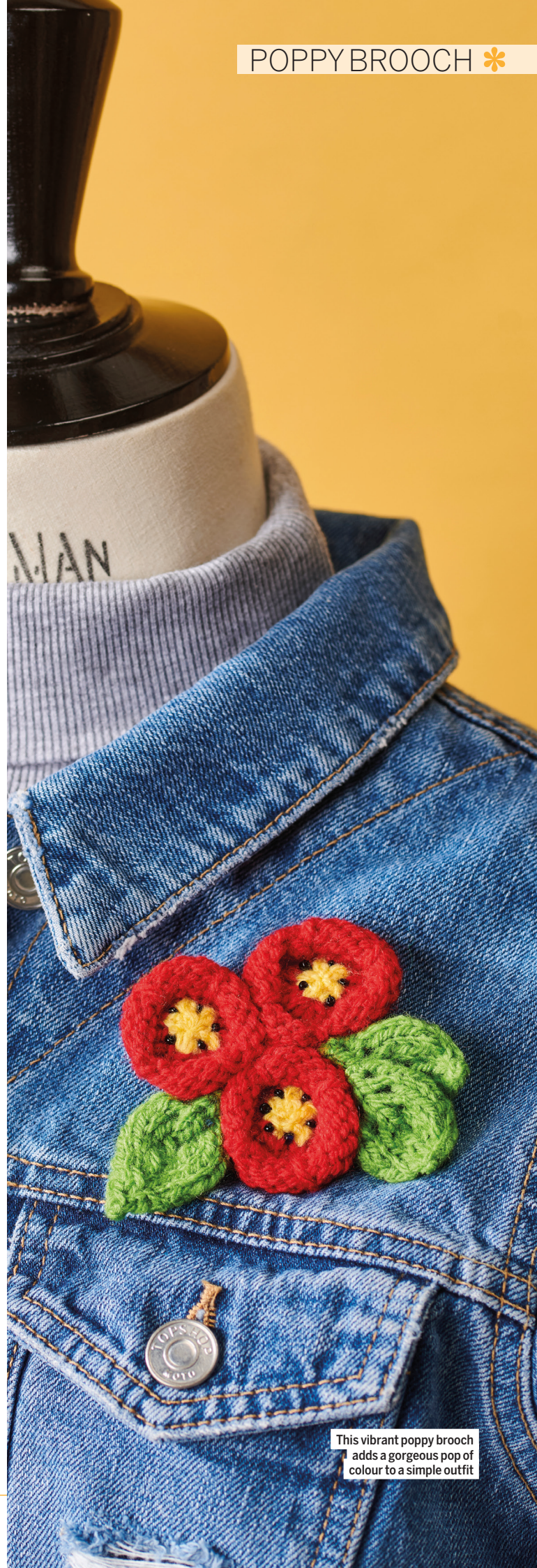
This vibrant poppy brooch adds a gorgeous pop of colour to a simple outfit