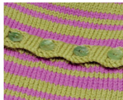
A contrasting colour scheme makes the most of the stripy pattern.

Line up the lower section of the back with the upper section of the back, ensuring