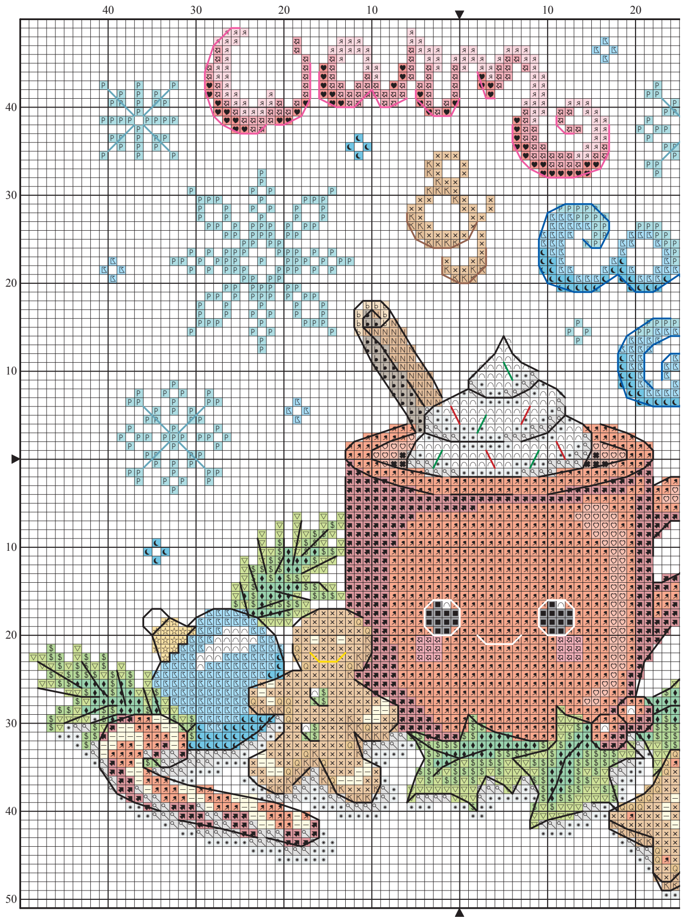
Kawaii Festive Mug chart (left)