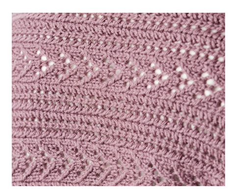
The lace pattern is worked over a 17 st repeat across 6 rows, with a g st border.

Talk about versatile! Worn over trousers, with a skirt or a dress, Monica Russel's lacy design is stylish and modern. Choose which way you wear it – as a shrug, a wrap or a poncho. The secret to its adaptability lies in its buttons. Fasten both sides to each other to create a poncho, fasten them at an angle to create a wrap, or join the top and bottom of each side to create a stunning long-sleeved summer shrug.