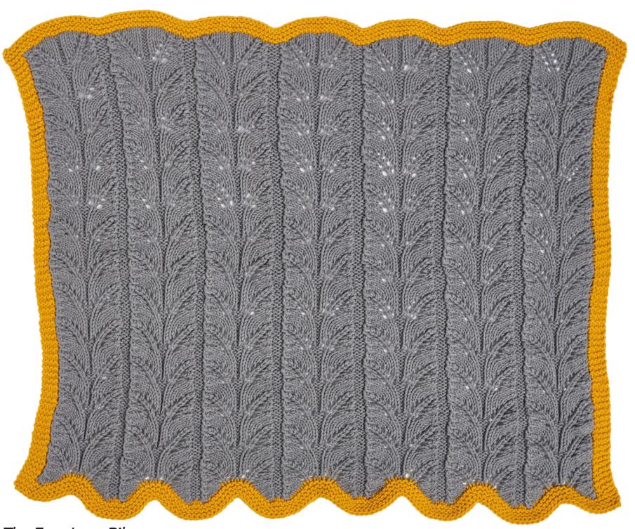
The Fern Lace Rib pattern creates a natural rippled effect at the top and bottom of the blanket.

Weave in ends and gently block to measurements, following any yarn care instructions on the ball band.