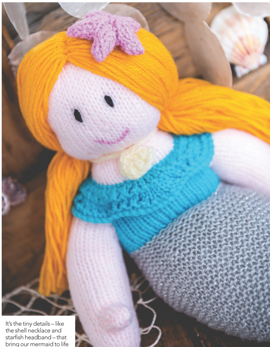
It's the tiny details – like the shell necklace and starfish headband – that bring our mermaid to life

Row 3: * (K2tog) twice, (yf, k1) four times,