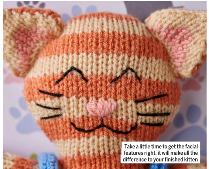
Take a little time to get the facial features right, it will make all the difference to your finished kitten

Next row Kfb, K to last st, kfb. [2 sts inc'd]