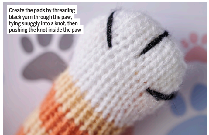
Create the pads by threading black yarn through the paw, tying snugly into a knot, then pushing the knot inside the paw