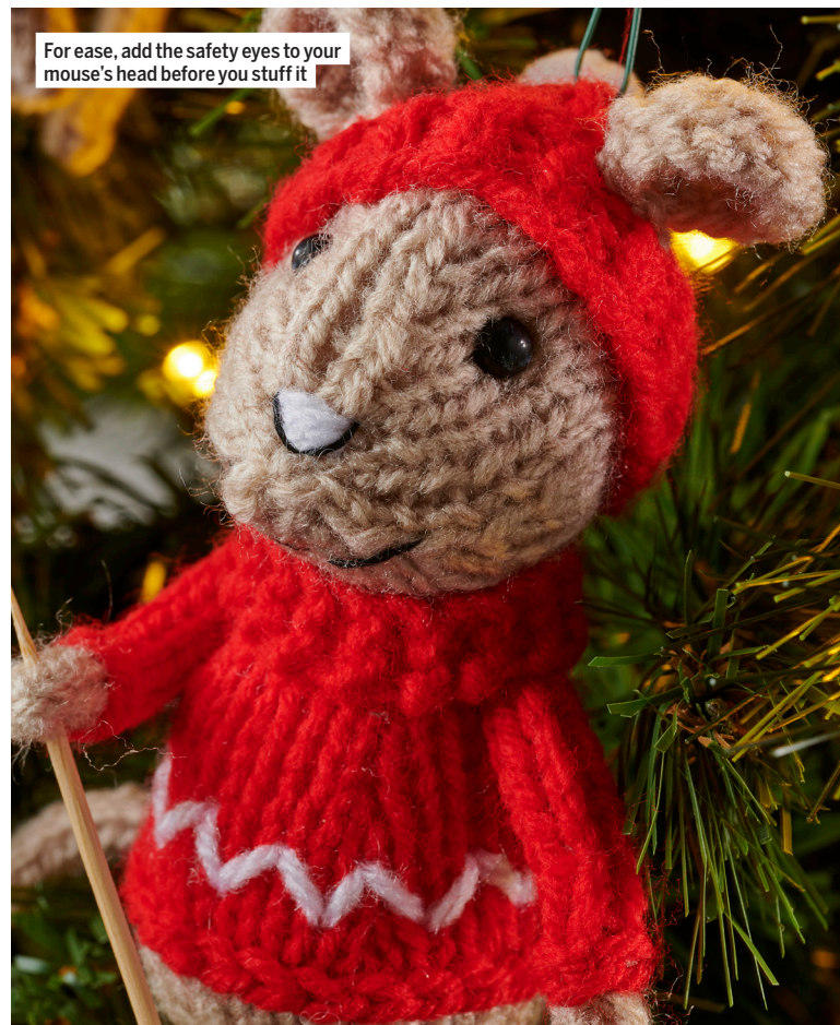
For ease, add the safety eyes to your mouse's head before you stuff it