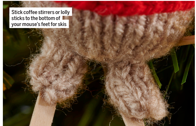
Stick coffee stirrers or lolly sticks to the bottom of your mouse's feet for skis