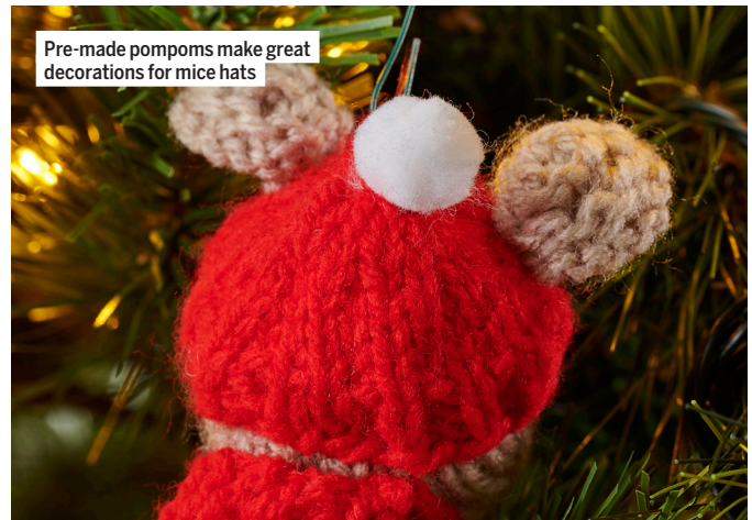
Pre-made pompoms make great decorations for mice hats