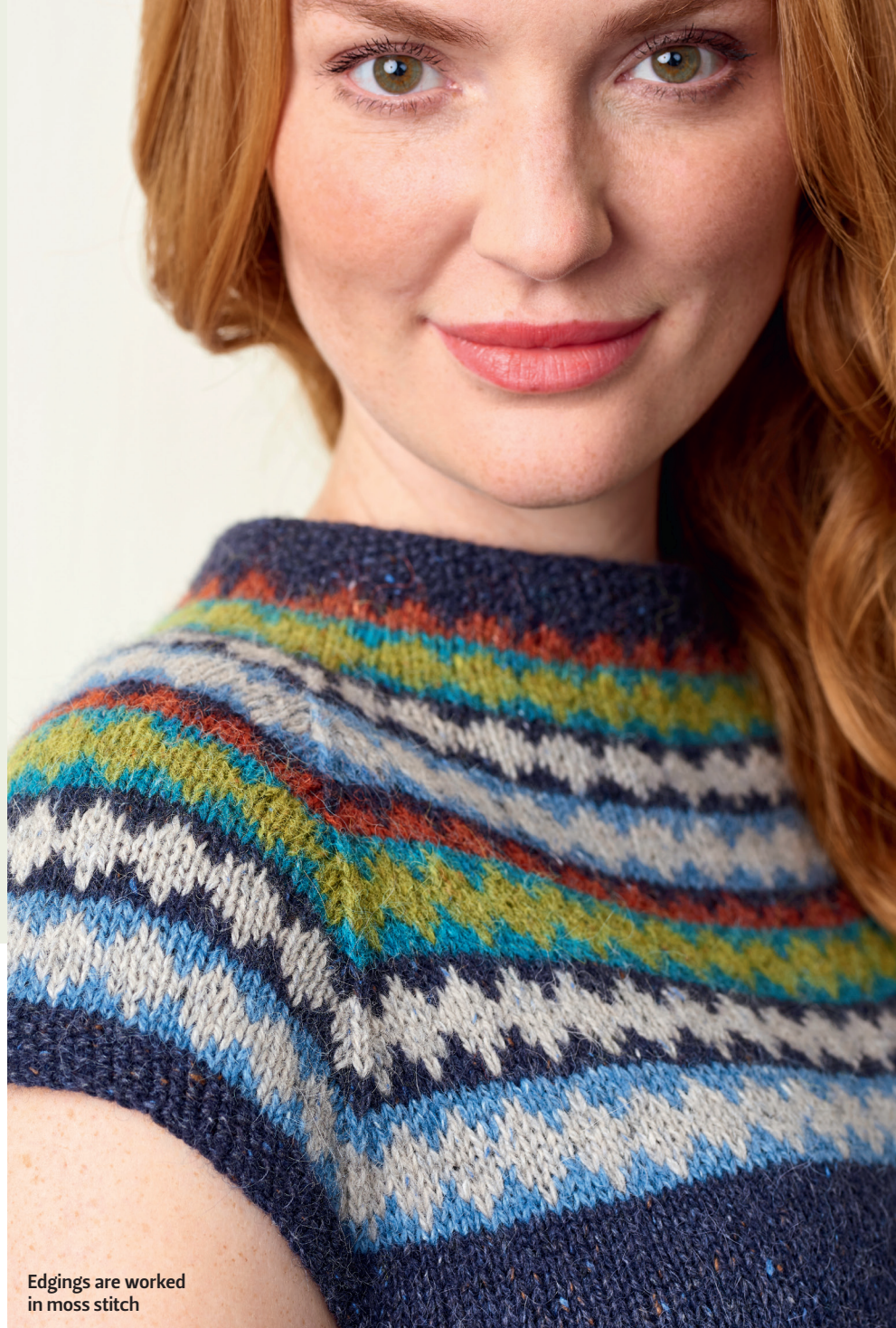
Edgings are worked in moss stitch

Gently block to measurements, following any yarn care instructions on the ball band. ☺