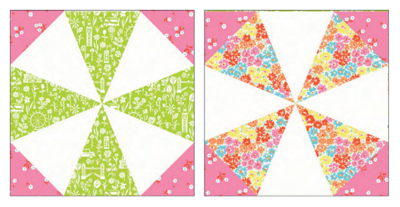
Pink Corner on White Triangle Pink Corner on Fabric Triangle

These instructions are to make 1 block. Refer to the quilt photo for piece placement. Sew a White Wiltshire Blender triangle to a printed fabric triangle. Repeat to make 4 sections. Sew the 4 sections together to make the center of the block. Sew the Primrose Hill B triangles to each corner to finish the block. Refer to quilt photo to know whether to place the Primrose Hill B on the White Wiltshire Blender or printed fabric corners. See diagram below. Repeat to make a total of 16 Blocks.