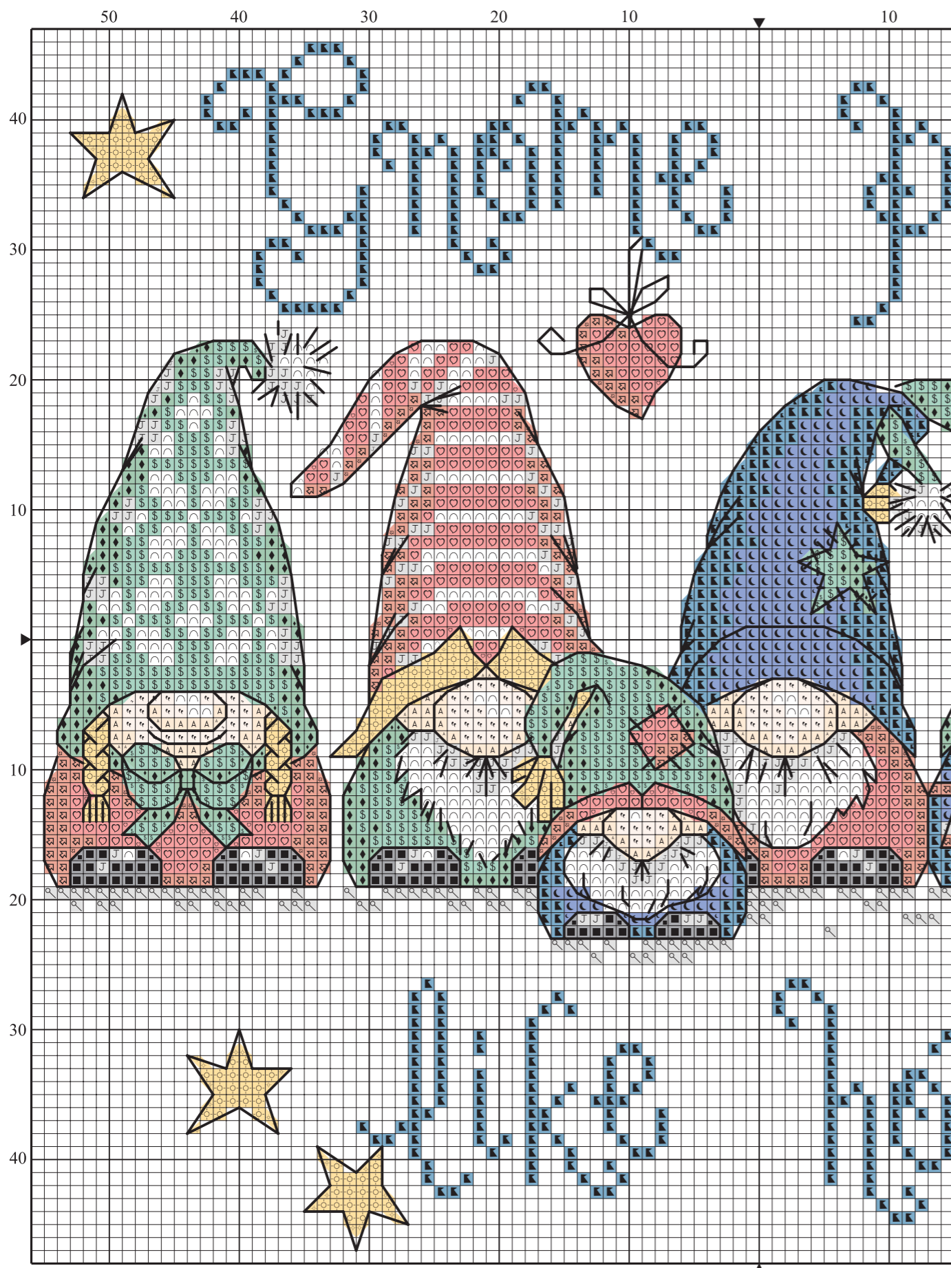
Whimsical Gnomes chart (left)