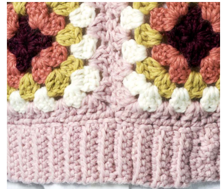
Ribbing is worked around the hem, armholes and neckline after the motifs have been joined

Row 6 (WS) Ch1, dc in each tr to corner ch-2 sp, (dc, ch2, dc) in corner ch-sp, dc in each tr to end.