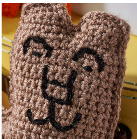
Use surface crochet or embroidery to work the animals' facial features in black outlines