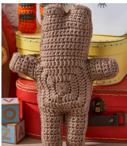
The bear's basic body is worked the same as the lion but in a different colour