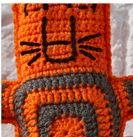
To join, place pieces rights sides out and seam around the outside, stuffing as you go