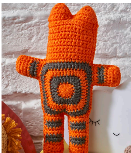
For the tiger, work the body in a striped pattern on the body, arms and legs

Skip 4 sts, join Yarn B in next st. Rep Rows 1-10 to make second Leg.