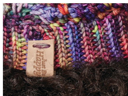
A ribbed band provides stretch to help your hat stay put on blustery winter walks

tail through all of the sts of the last round and pulling tight to close, then weave the end in onto the WS.