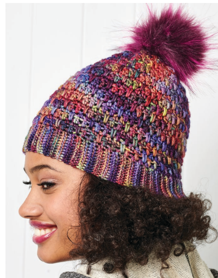
Variegated wool means that every hat has a slightly different colouration pattern

Using the long tail, sew the opening of the hat closed. You can do this by threading the